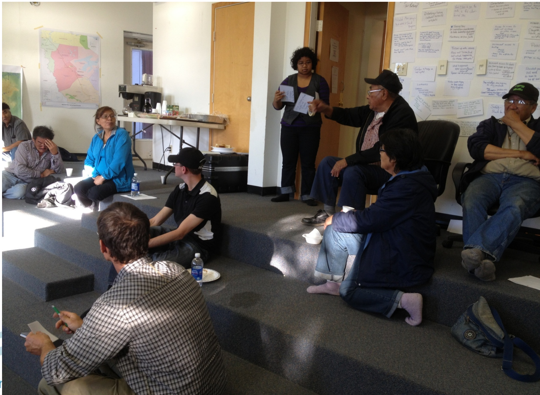
Working together to make wise decisions