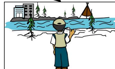
Developer's Assessment Report