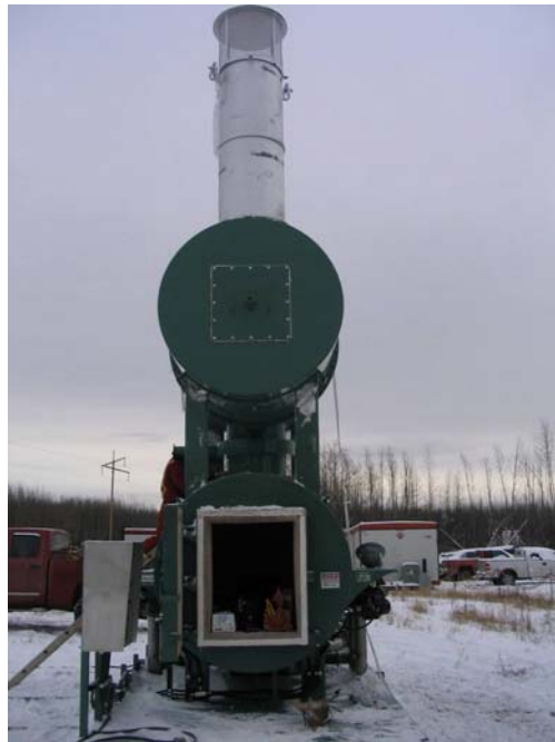
Figure 2.2 Typical Controlled Air Dual Chamber Incinerator