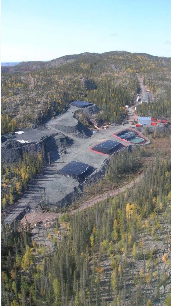
Test mining 2006/2007