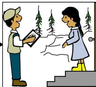
Scoping/Terms of Reference/workplan