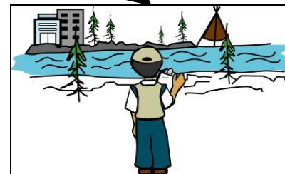
Developer's Assessment Report