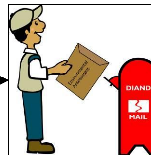
Responsible Ministers Decision