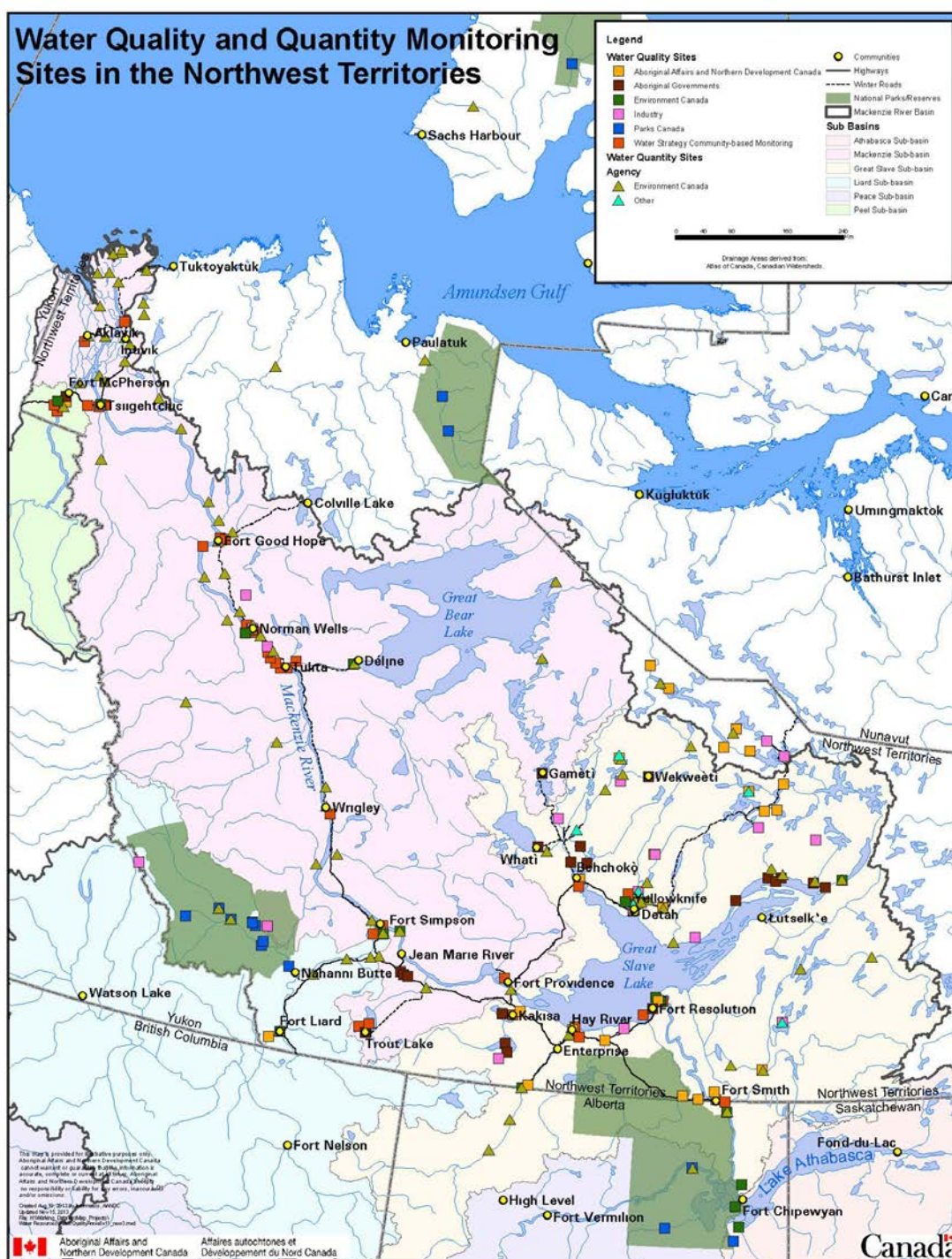
Figure 2: Water Monitoring Programs in the NWT

(Note: The map was produced prior to devolution (April 1, 2014); therefore, monitoring sites depicted as "Aboriginal Affairs and Northern Development Canada" are now led by GNWT-ENR.)