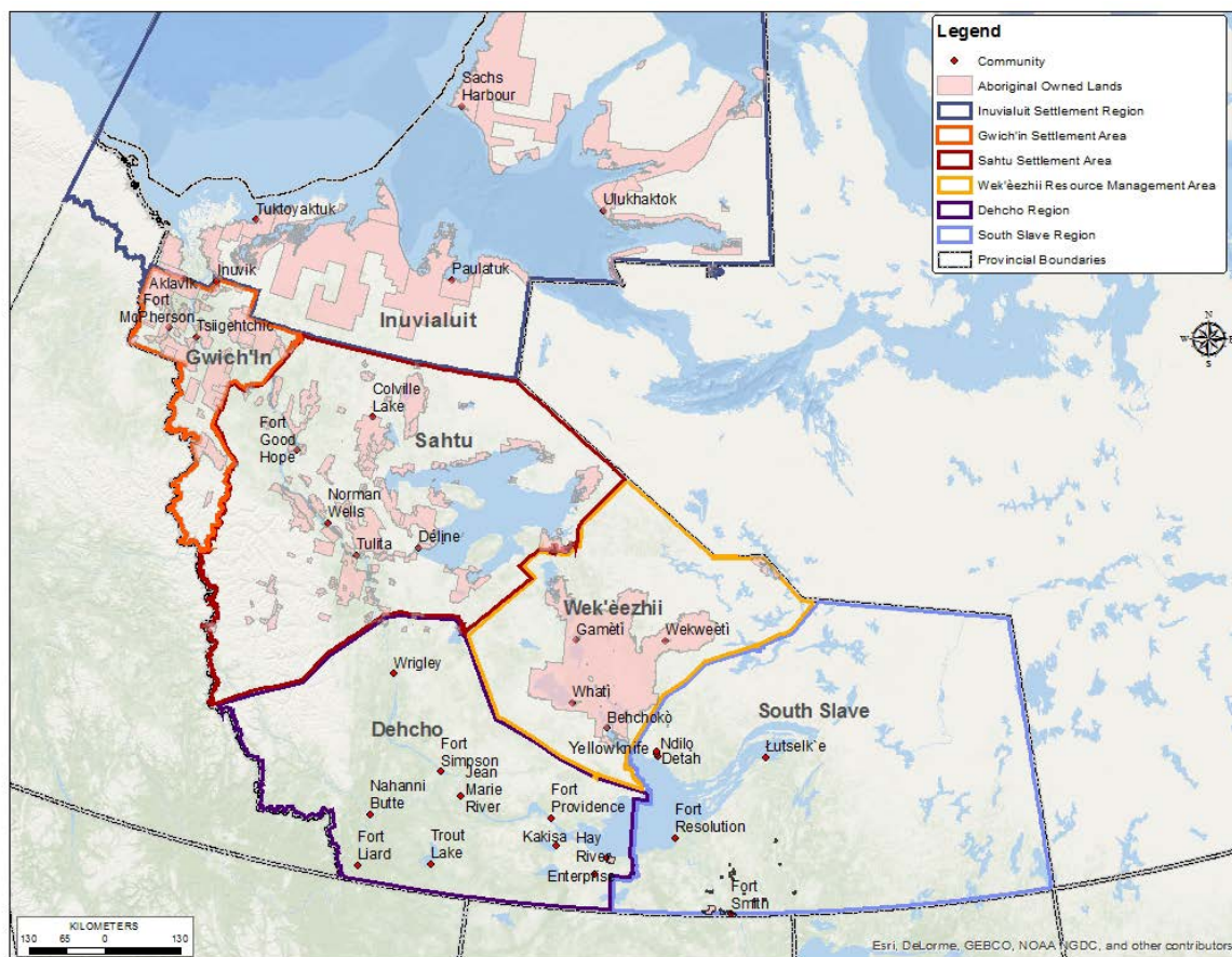
Figure 1: Geographic Scope of the NWT Audit