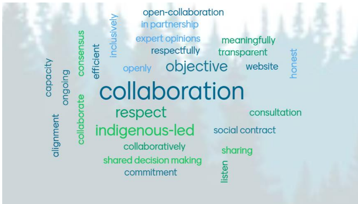
Figure 6: MVERIB RSEA workshop, Mentimeter word cloud – Guiding principles

At the close of the workshop, participants were asked to identify the principles by which they would like to work together and to share them via Mentimeter. The following Word Cloud was generated: