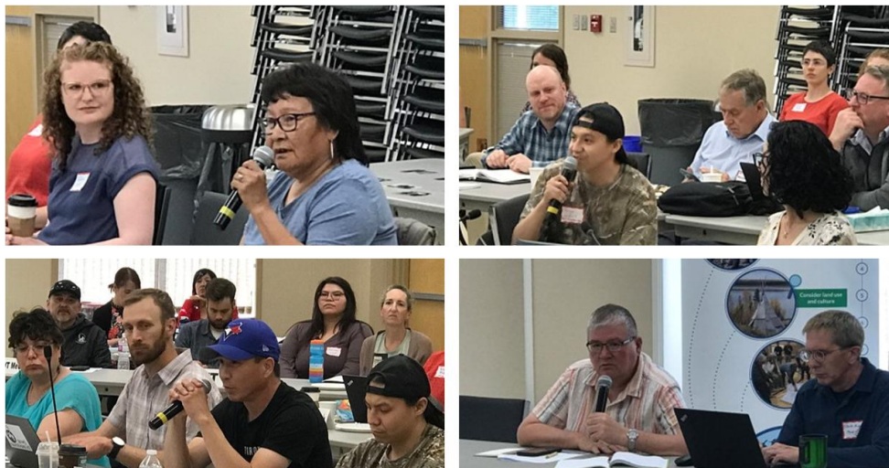
In-person participants sharing their end of day reflections