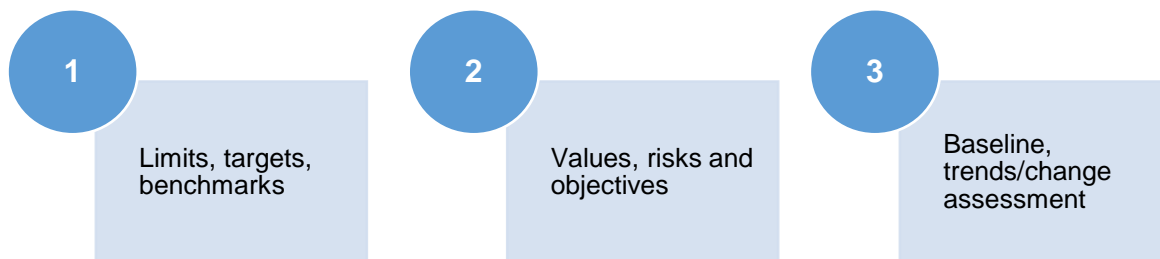
Figure 3: Fundamental outputs of an RSEA as recommended by Dr. Noble

Dr. Noble also noted that RSEAs cannot function in isolation of other policies and activities. For example, RSEAs should be informed by project level assessments and must also inform upstream policies and planning. He continued that there are three fundamental outputs from an RSEA which provide direction for decisions both at the project and regional level: