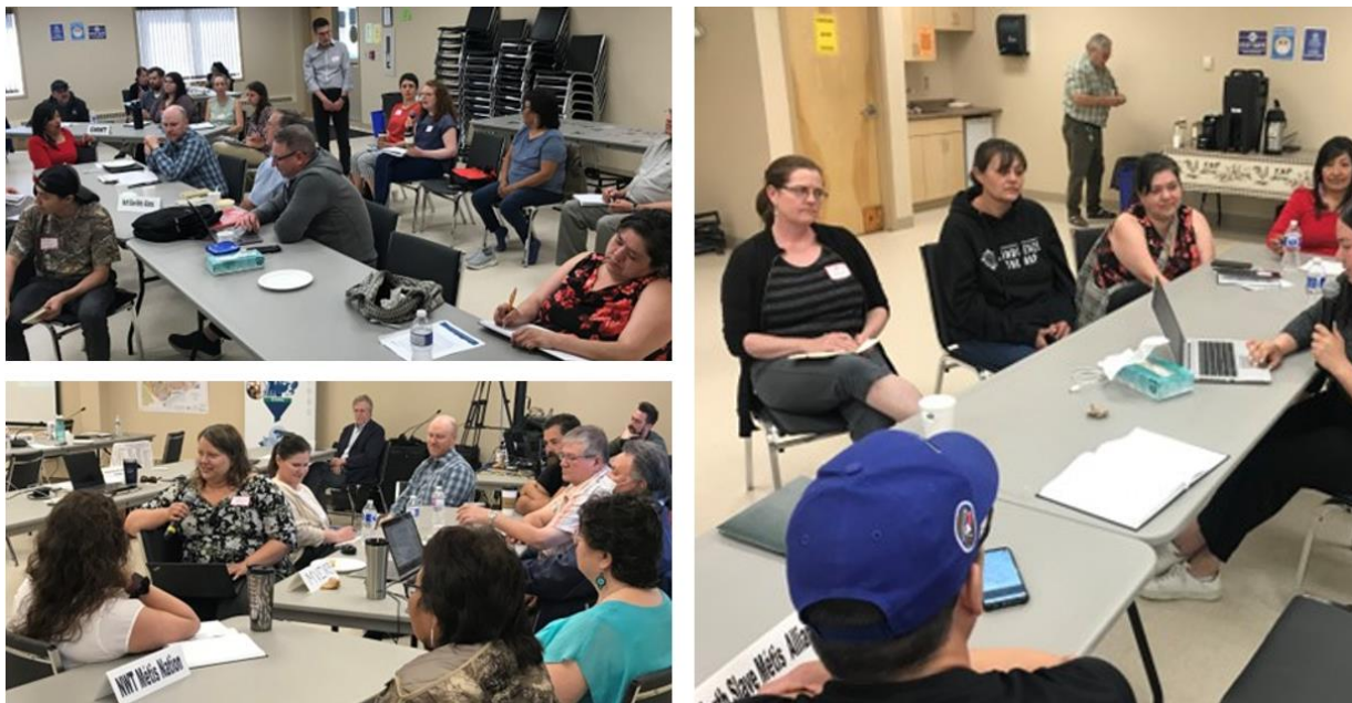
In-person participants at the Tree of Peace Center in Yellowknife

Crown Indigenous Relations and Northern Affairs Canada (CIRNAC) is seeking written responses from interested parties to inform a ministerial recommendation on if and how a RSEA in the SGP could move forward. Participating governments and organizations were invited to submit their recommendations and views in writing by July 29 th , 2022 or indicate to CIRNAC if an extension is required.