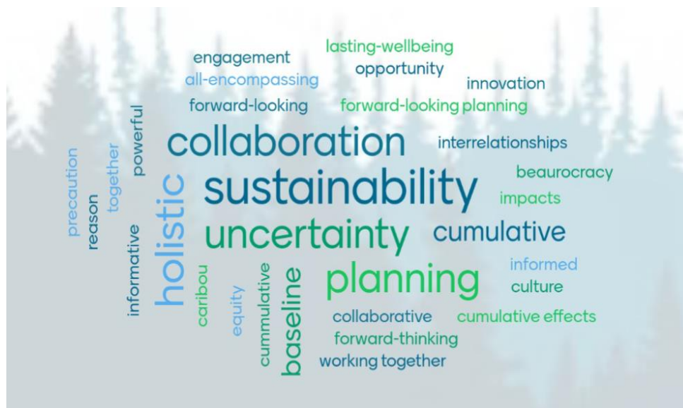
Figure 2: Participant responses to Mentimeter opening question

Through a Mentimeter exercise, the facilitator asked a question to all participants: "In one word, please share what comes to mind when you think about an RSEA". The word cloud below shows participant responses.