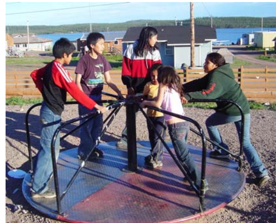
Enjoying the summer sun in Lutsel K'e

Developer's Final Comments—September 14, 2006