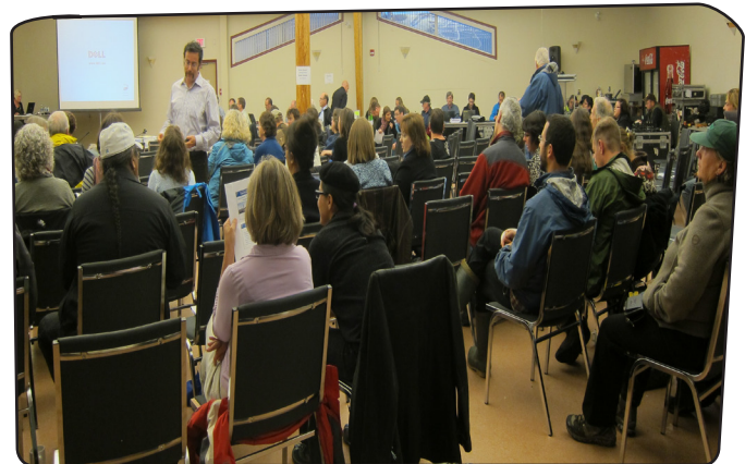
Giant public hearing on September 10th.

The Mackenzie Valley Review Board held community and public hearings into the proposed Giant Remediation Project near Yellowknife on September 10-14. These hearings were held in Yellowknife and Dettah and were well attended by all parties and members of the public. In an effort to ensure an open and transparent process, the Review Board provided translation in the Tlicho language at all the sessions and also broadcasted the hearings via webcast.