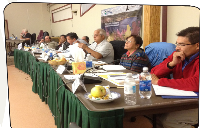
Review Board members-Giant public hearing.

The parties that presented at these hearings were Aboriginal Affairs and Northern Development Canada, Government of the Northwest Territories, City of Yellowknife, Yellowknives Dene First Nation, Alternatives North, North Slave Metis Alliance, Environment Canada and Department of Fisheries and Oceans. The Review Board also heard from several members of the public; including residents of the city of Yellowknife and Yellowknife Dettah First Nation in Dettah. The Review Board is now entering careful deliberations regarding its decision and anticipates releasing its decision in the first quarter of 2013.