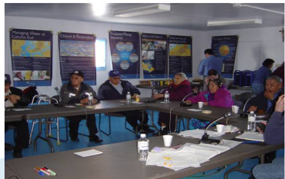
Community Scoping Workshop, Dettah

After a technical scoping workshop and hearing in Yellowknife; community scoping workshops in Dettah, Lutsel k'e, Fort Resolution, Behchoko; and, a final community scoping hearing on April 28 th , 2006, the Review Board is considering information presented by the parties and the public as it drafts the Terms of Reference.