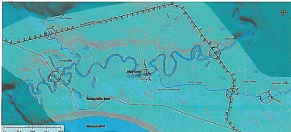
Figure 1 Oscar Creek Tributary Realignment

On October 25, 2019, the Board received an Amendment Application to allow an additional borehole to be drilled on each side of Oscar Creek at the proposed alternate location. The coordinates of these two additional boreholes are: 65°26'8.97"N and 127°24'33.20"W. Access will be obtained from the existing winter road to Oscar Creek, requiring approximately 1 ha of additional clearing.