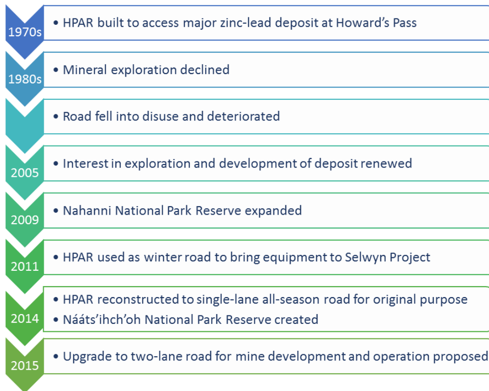
Figure 3: History of the Howard's Pass Access Road

The proposed HPAR upgrade program is to widen the road to 8.5 m and make minor adjustments in alignment to improve the road design. The current surface area disturbed is approximately 35.6 ha for the road footprint, 63.2 ha for cut/fill slopes and areas cleared of vegetation along the HPAR, and a 2.3 ha area that was cleared for the construction camp and laydown area for the 2014 road reconstruction. Road widening and local re-alignments associated with this Project would result in a further estimated 85.9 ha being disturbed. In addition, construction activities will require land for additional temporary camps/laydown areas and for quarries, resulting in a disturbance of about