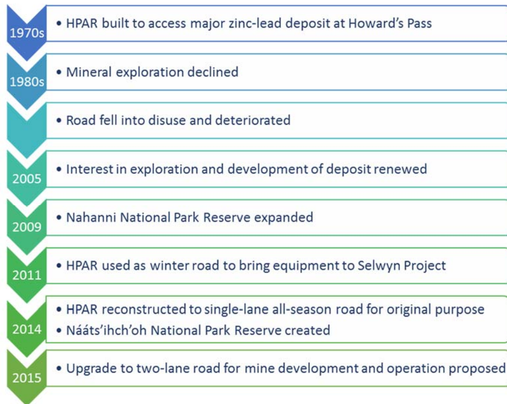
Figure 3: History of the Howard's Pass Access Road

The proposed HPAR upgrade program is to widen the road to 8.5 m and make minor adjustments in alignment to improve the road design. The current surface area disturbed is approximately 35.6 ha for the road footprint, 63.2 ha for cut/fill slopes and areas cleared of vegetation along the HPAR, and a 2.3 ha area that was cleared for the construction camp and laydown area for the 2014 road reconstruction. Road widening and local re-alignments associated with this Project would result in a further estimated 85.9 ha being disturbed. In addition, construction activities will require land for additional temporary camps/laydown areas and for quarries, resulting in a disturbance of about