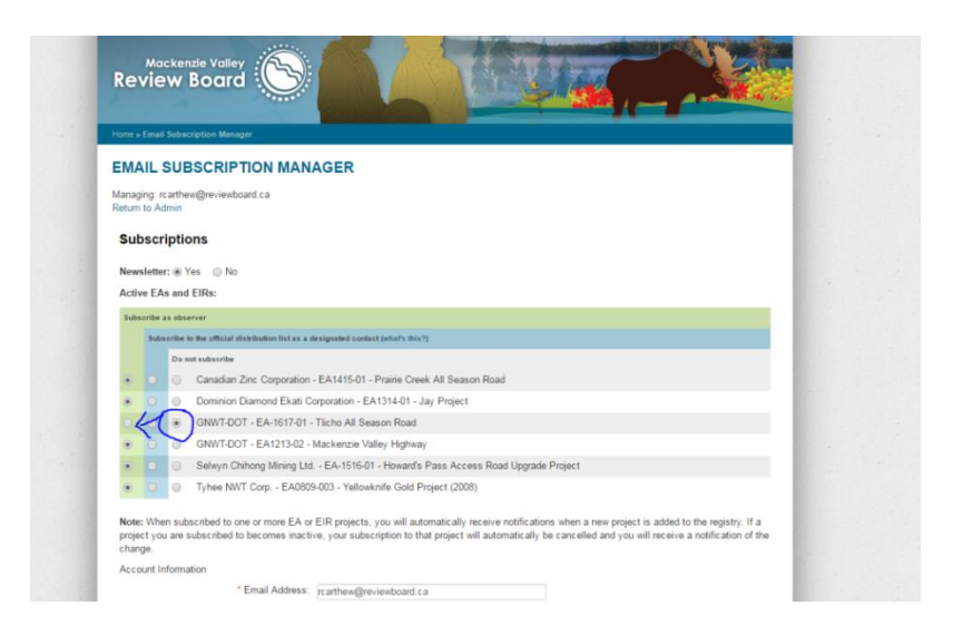
Step 4. Confirming you're Subscription

Once logged in, your screen should look like the image below. Simply click on the option you want, and then click the 'register' button at the bottom of the screen. It is important to remember that only you can subscribe, and that it must be done for every EA you want to get info on.