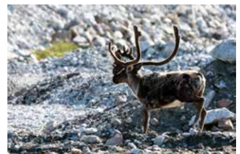
Caribou at the Ekati mine.

Because LKDFN hunts primarily the Beverly herd, they have requested support to monitor the health of the caribou and ensure that hunters are acting responsibly when out on the land, and are not wasting meat by taking only the most desirable parts of the caribou.