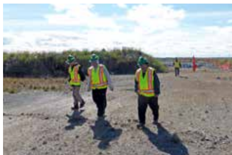
Participants in the Caribou Engagement Program from Kugluktuk observing caribou protection measures (August 17-20).

In recognition of their traditional use of the area and knowledge of the caribou and their habitat, the participants were flown by helicopter to the potential Sable Road to select suitable areas for caribou crossings.