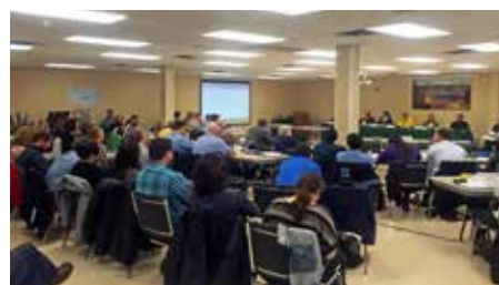
The third day of the Jay Public Hearings took place at the Tree of Peace Friendship Centre.

The first day of the Yellowknife sessions dealt with socio-economic effects and air quality.