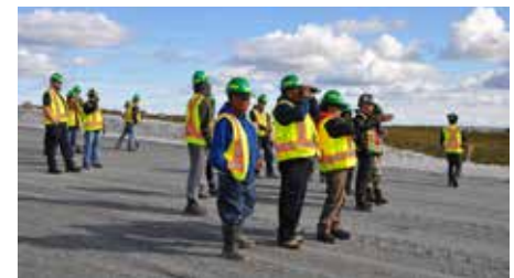
Participants in the Caribou Engagement Program from NSMA, LKDFN, and YKDFN observing a constructed Lynx caribou crossing (August 24-27).