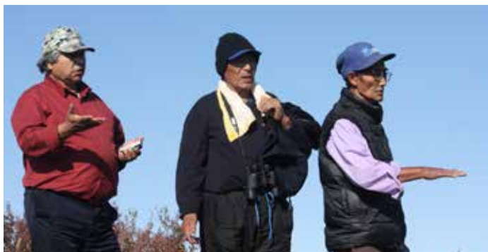
Tłjcho elders providing advice on the design of waste rock piles.

The Elders and other community members traveled to the Ekati mine to observe the landscape around the existing mine site and the proposed Jay Project.