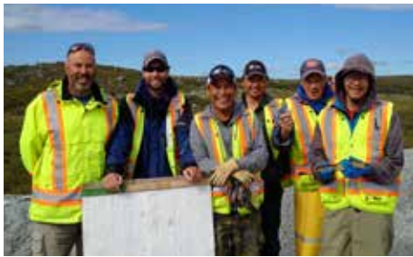
One of the fish-out crews at Lynx Lake getting ready for a busy day.