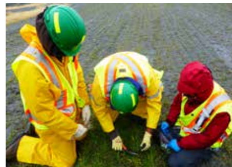
Students conducting soil sampling at Cell B.