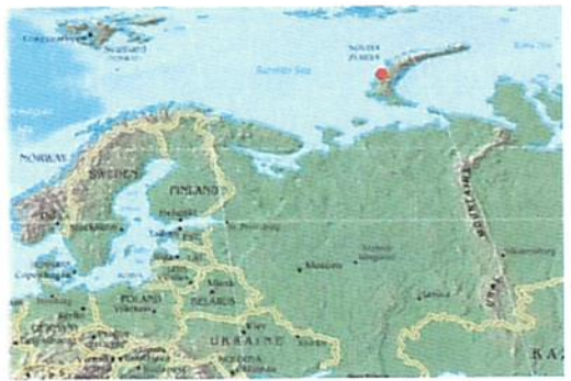
Figure 1: Map Showing the Location of the Novaya Zemlya Archipelago

In 2023, Russia's Ministry of Defense released plans to expand and modernize its Rogachevo Air Base on the islands of Novaya Zemlya. It plans to add hangers and extend the airstrip to accommodate long-range interceptors and strategic bombers.<sup>28</sup>