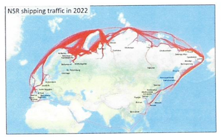
Figure 3: NSR Traffic in 2022 – NSR Information Office<sup>46</sup>

The Russian government approved a strategic plan to develop the infrastructure needed for the NSR. This project was estimated to last until 2035 and cost close to 29 billion USD. In 2022, Russia estimated that 34 million tons of cargo crossed the NSR, which is up from 4 million tons in 2014, and that it will surge to 200 million tons by 2030.<sup>44</sup> This does not seem to be a fantastical aspiration as Russia aims to have more than 80 million tons traverse the same route in 2024.<sup>45</sup>